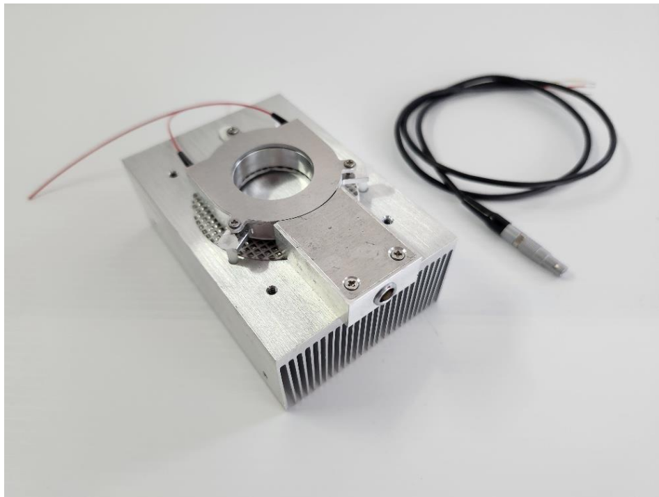
Fig. 1. OEFBG-TUN-STT Thermo-Tunable FBG Filter (OEM)